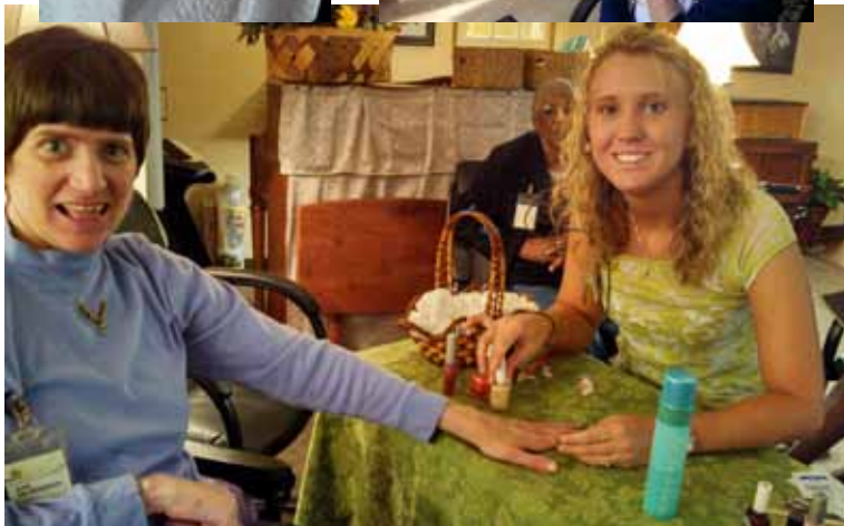
Spa Treatment - Happy Mother's Day!

"This makes life worth living"- a comment made by a participant while sitting in our new tub when she felt the soothing water from the whirlpool jets against her body.